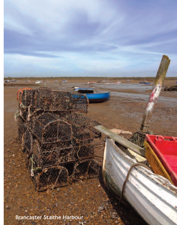
Brancaester Staithe Harbour